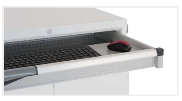
Drawer equipped with gray RAL 7035 painted top for keyboard.